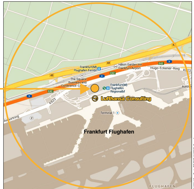
Frankfurt am Main/Airport